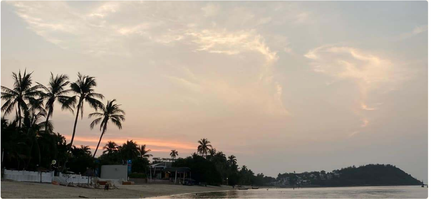
The Khanom strip at dusk — the one night out of Aava.