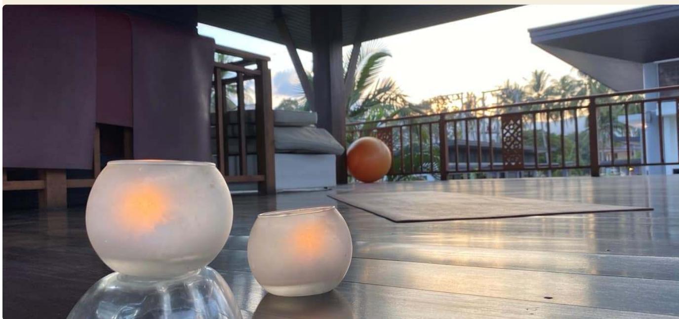
The Aava deck at dusk — where the session lands.

One session at this length, your choice. The yin runs forty-five minutes on the Aava deck before dinner cools off — long held floor poses, the kind of session that does the work after a day on a bike. The lecture is an hour of working talk from Gabe on building a life around teaching and travel in Thailand — closer to a long fireside conversation than a motivational session. Tell us before arrival which one fits.