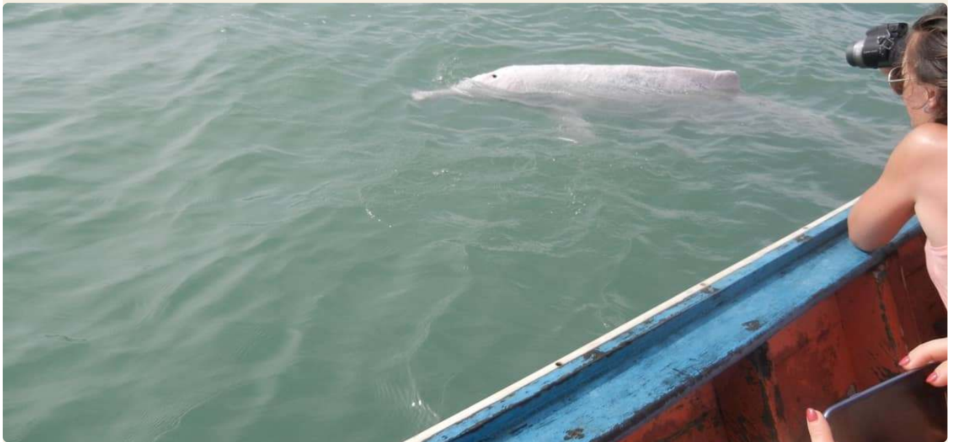
Pink dolphin — Khanom-Don Sak channel, year-round.

Early start — the boats go out around 6:30–7:00 AM, which is when the dolphins are feeding closest to shore. Pink dolphins — Indo-Pacific humpback dolphins, pink because of blood vessels close to the skin — live in the Khanom-Don Sak channel year-round. Two to three hours on the water. A 14-minute longtail past the fish farm gets you to where they feed. Hats, water, and the understanding that wildlife doesn't keep a schedule. Back to the resort by mid-morning.