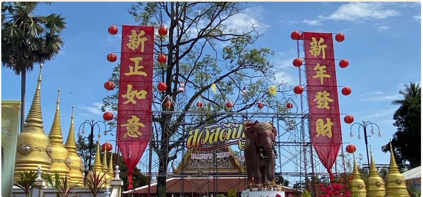
Ai Kai — the open-day cultural option.

Operator decides on the day with the couple. Pack the bags soft in the evening. Last Khanom dinner at Aava — the deck, the candles, the included final-night meal.