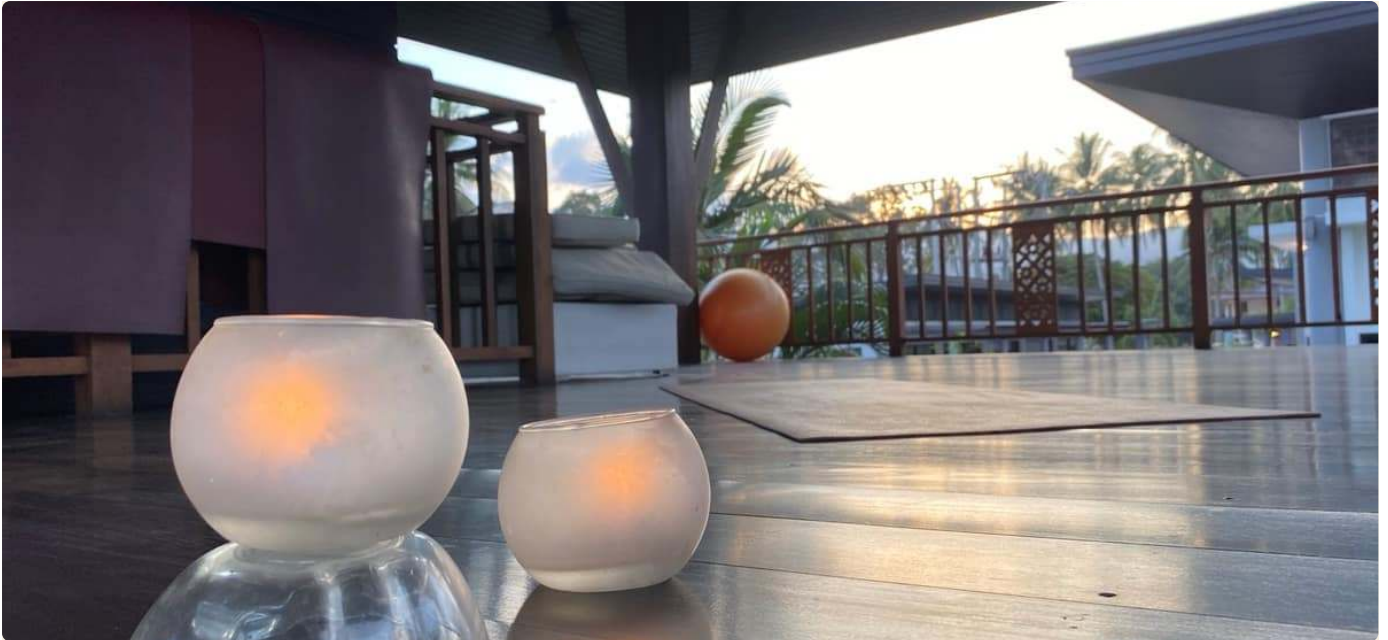
The Aava deck at dusk — first-night close.