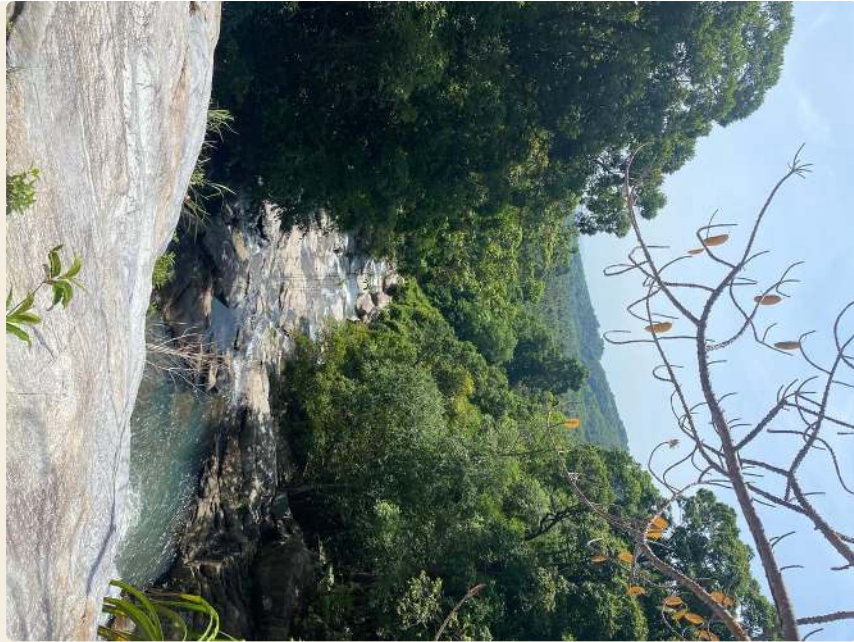
Samet Chun — the view from the upper pool.

Back to Aava. Pool, a swim, a slow rinse. Dinner at the resort — included.