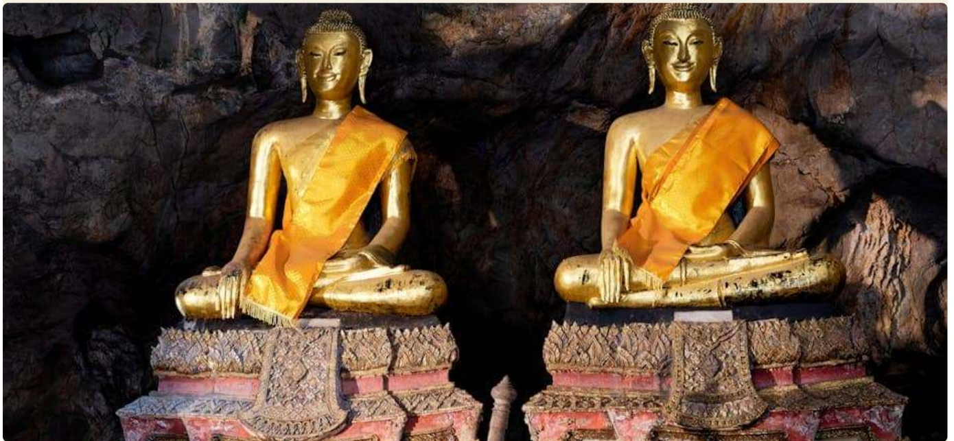
Suwankuha — the working cave temple along the route.