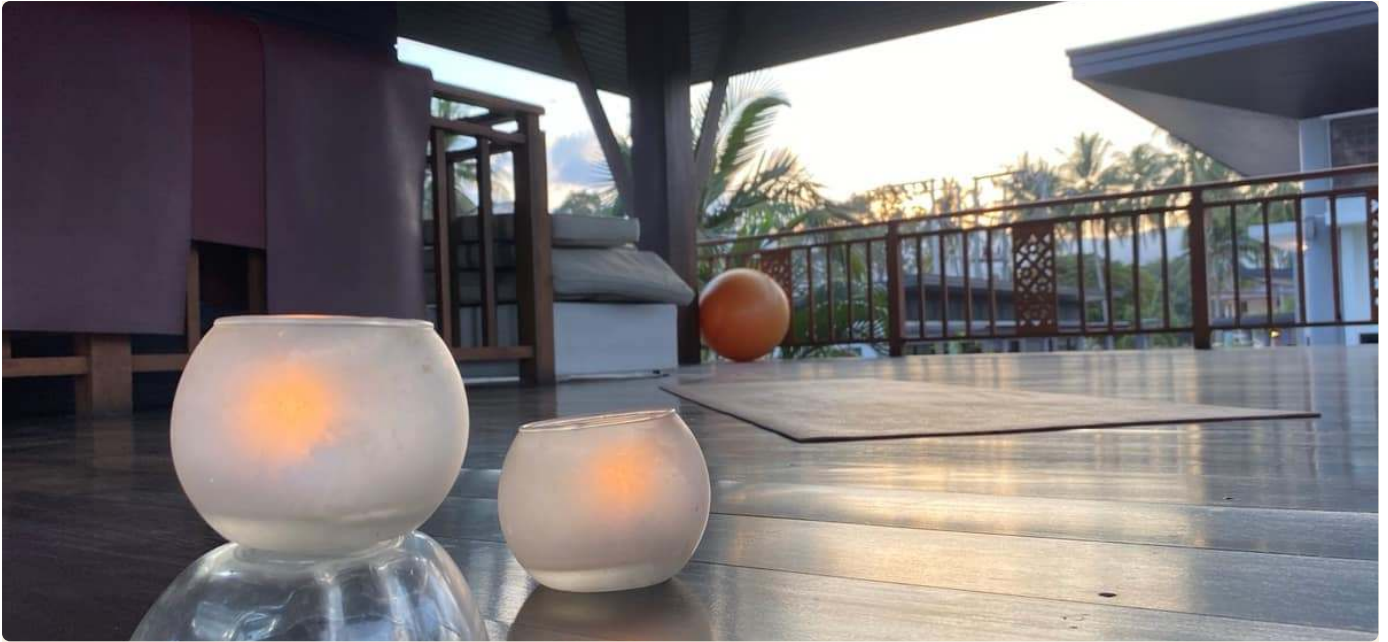
The deck at dusk — the yin session lands here.