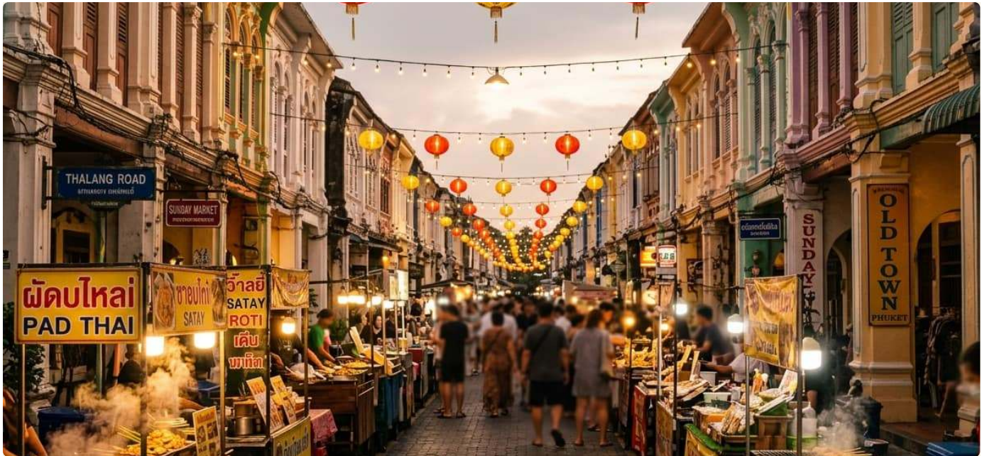
Thalang Road texture — the cultural pivot before the drive south.