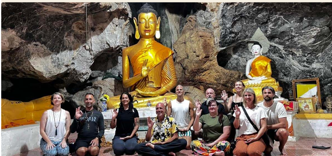
Mother of Buddha — a wide chamber, no scrambling.

Afternoon: Mother of Buddha Cave + Natural Fish Spa , both in the hills behind Khanom, both half-days that fit together cleanly. Mother of Buddha is a wide chamber with a natural stone formation the local Buddhists revere; the path in is well-lit and stair-built, no scrambling, walkable for the whole family. The Natural Fish Spa is a clear river spot where small fish nibble dead skin off your feet — free, public, the kids will be torn between hysterical laughter and not wanting to put their feet back in.