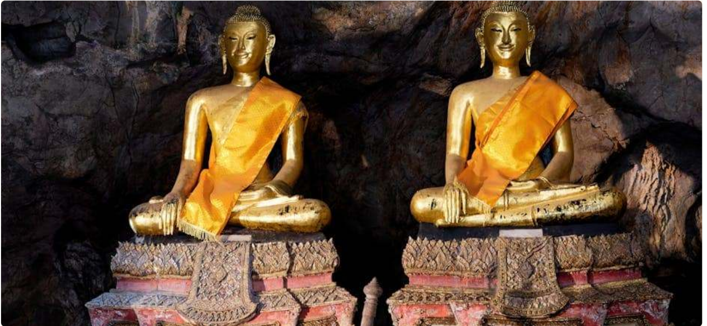
Suwankuha — the working cave temple along the route.

Lunch separately on the route. Arrive Bamboo Resort late afternoon. Beach dinner next door.